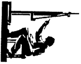
For students seeking a Fine Arts degree

The recipient will be selected by the John A. Logan College Scholarship Committee.