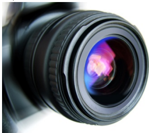
PHOTO EDITING – DIGITAL (6ACE 253). Come learn simple little editing tricks, simple techniques to fix photo crop, fix red eyes, and print photos and much more. Sessions: 10, Tuition: $114.00, Fee: $10.00

Section No. 3: Alongi DuQuoin Extension Center, Room DQ5, Meets Tuesday beginning January 26, 5:00P-7:00P, Instructor: Brenda Teaney