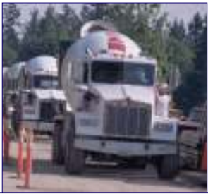
Odum Concrete roll a few trucks in with the concrete for the slab-on-grade foundation that the complex will be built on.