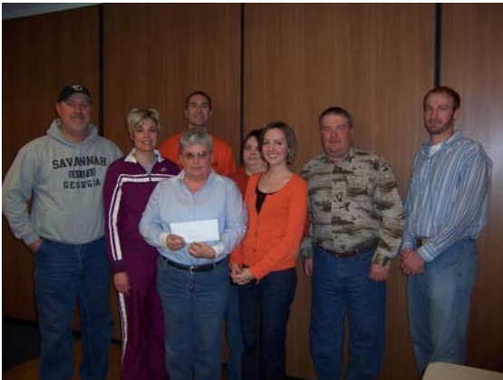
First Place Team