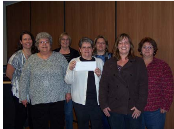
Second Place Team